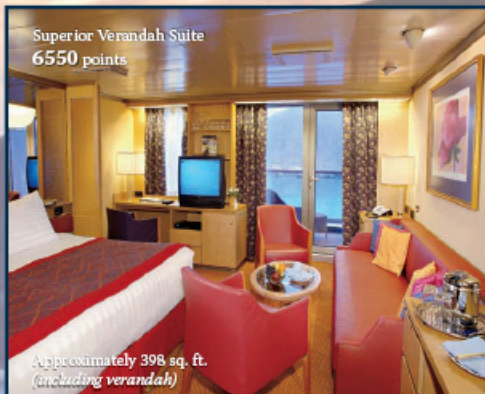
Superior Verandah Suite 6550 points

Approximately 398 sq. ft. (including verandah)