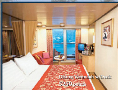
Deluxe Verandah w/Deck 5250 points

Two lower beds, convertible to a queen-size bed and bathtub & shower. Approx. 185 sq. ft.