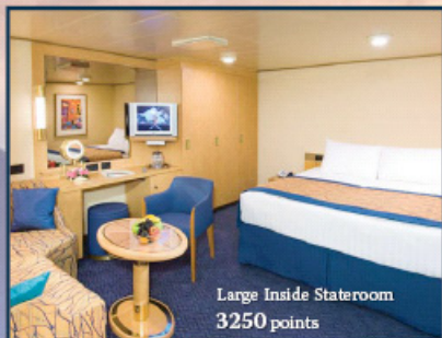
Large Inside Stateroom 3250 points

Two lower beds, convertible to a queen-size, shower Approx. 170-200 sq. ft.