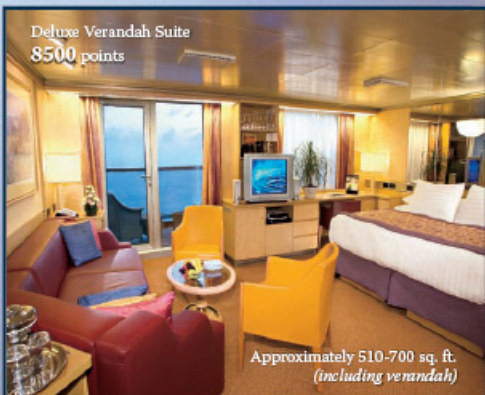
Deluxe Verandah Suite 8500 points

Two lower beds, convertible to a queen-size bed, bathroom with dual sink vanity, full-size whirlpool bath, shower with additional shower stall, large sitting area, private verandah, one sofa-bed for single person, floor-to-ceiling windows.