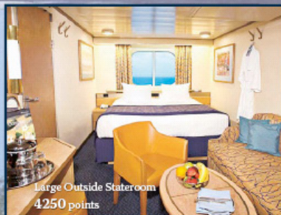
Large Outside Stateroom 4250 points

Two lower beds, convertible to a queen-size, shower Approx. 170-200 sq. ft.